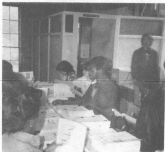
Study Hall students help prepare the last Alumni News for mailing.