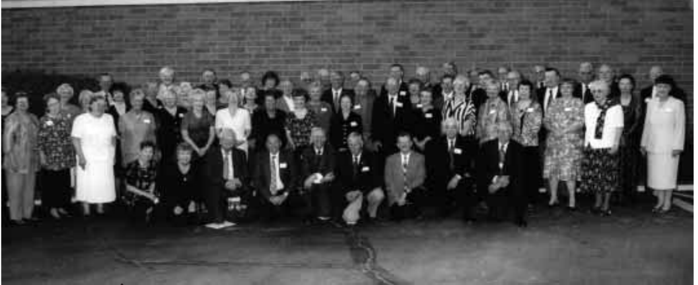
: ..... • Class of 1951 50th Reunion September 22, 2001 Radisson Cleveland Southwest Hotel