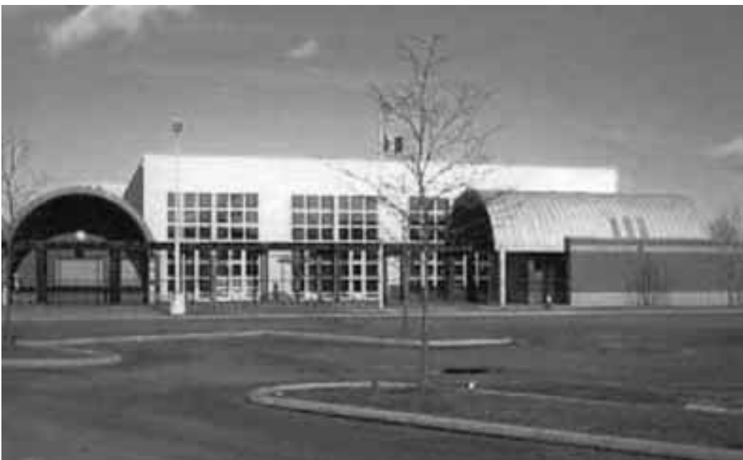
..... : : Gunning Park used to be a neighborhood swimming pool. Now this beautiful structure is a recreation center with many activities. Located on the corner of West 168th and Puritas.