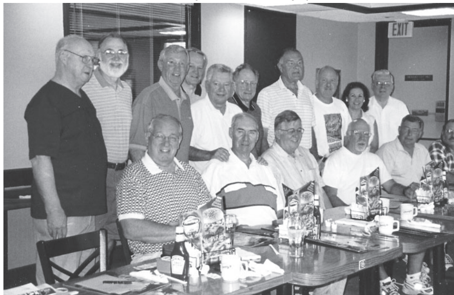
Some of the JMH retired faculty meet monthly for breakfast. They graciously posed for this picture BEFORE they ate.