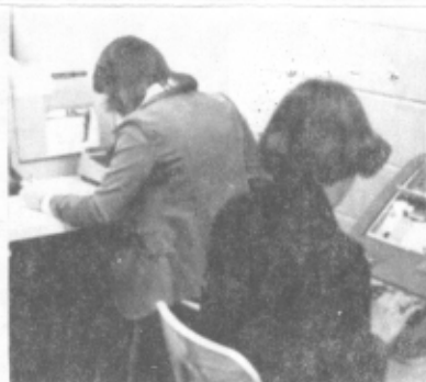
Key punching and verification are done in the Data Processing Lab.