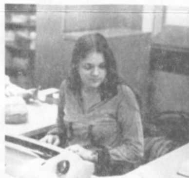
Typing correspondence in the Stenography Lab.