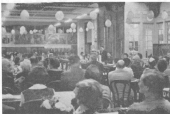
1959 SPORTS BANQUET IN THE CAFE.