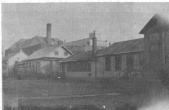
PORTABLES AT WEST PARK HIGH.