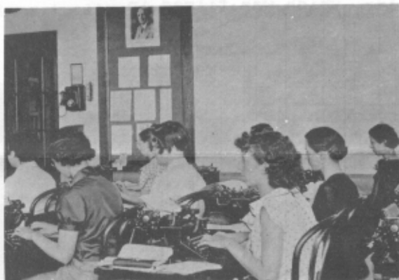
TYPING CLASS ABOUT 1934.

ALUMNI ASSOCIATION JOHN MARSHALL HIGH SCHOOL 3952 WEST 140th ST. CLEVELAND, OHIO 44111-9990